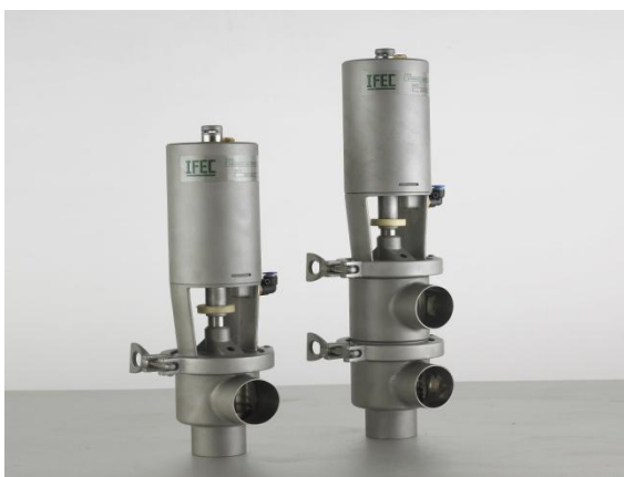
Old Reversing Valve