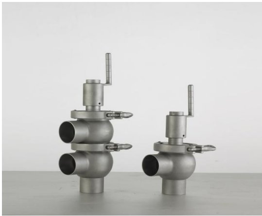
Manual reversing valve