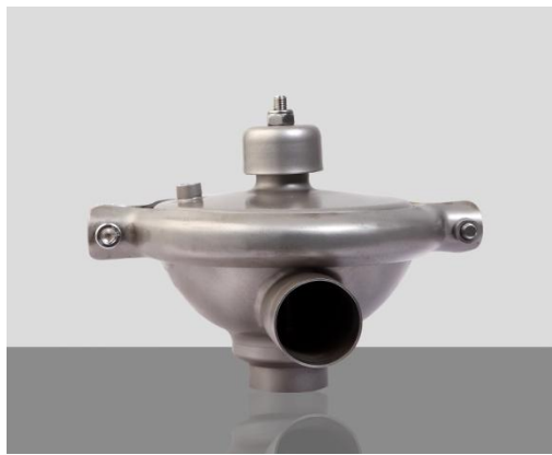
constant pressure valve