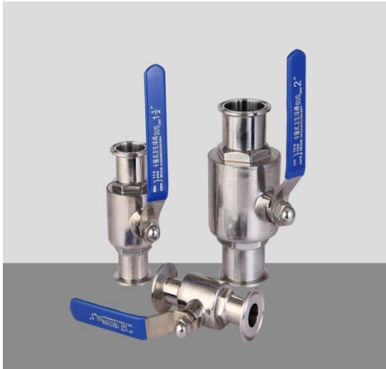
Sanitary ball valve