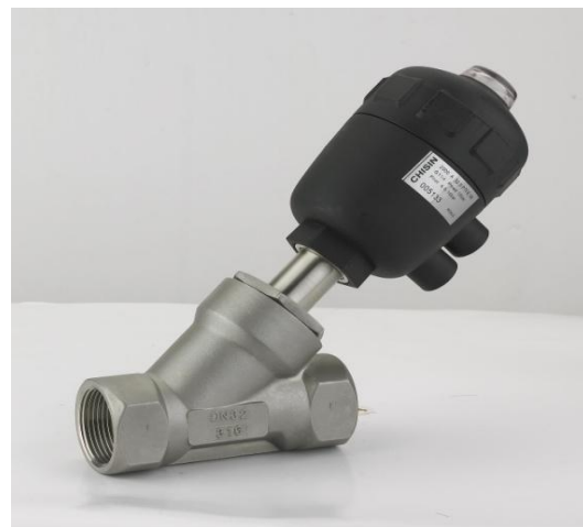
Angle Seat Valve