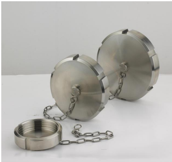
Sanitary blank nut