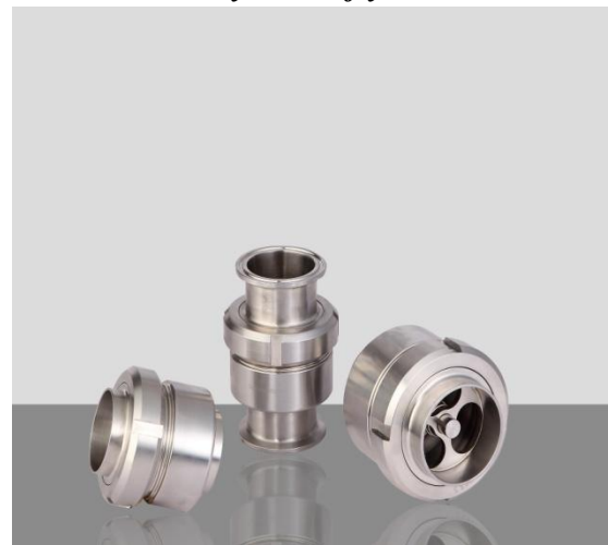
Sanitary Check Valve