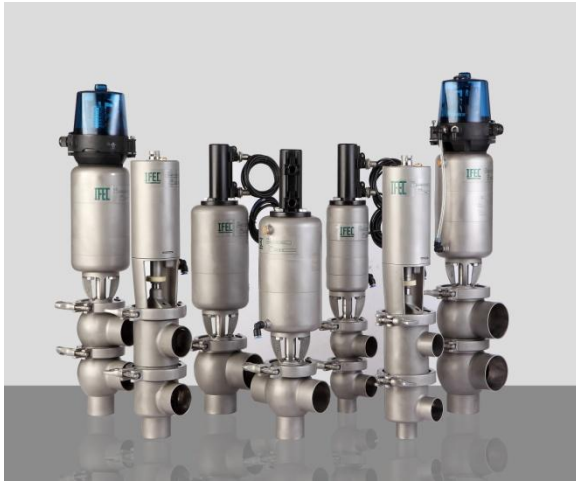
Pneumatic Reversing Valve