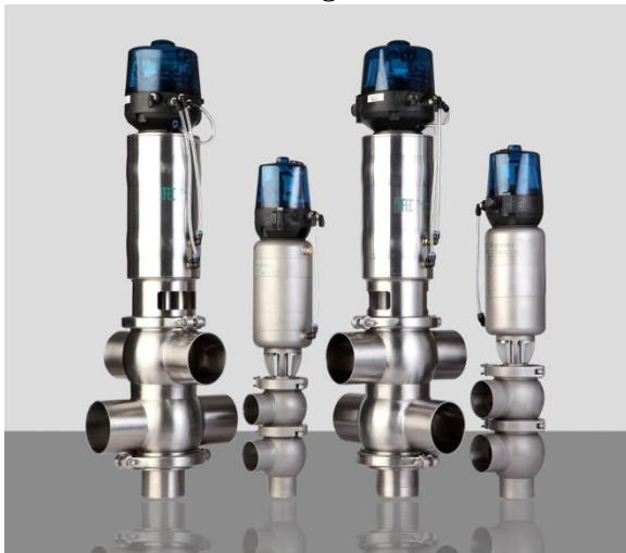
Sanitary Double Mix-proof Valve