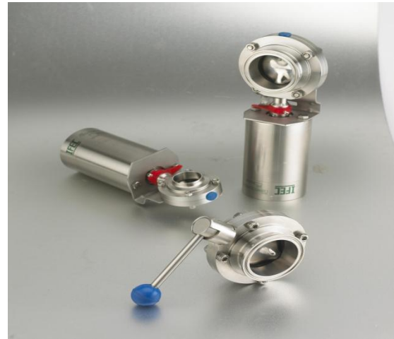
Sanitary Butterfly Valve